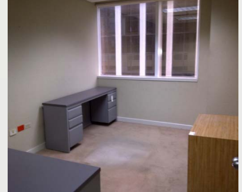
Picture of Vacant Space